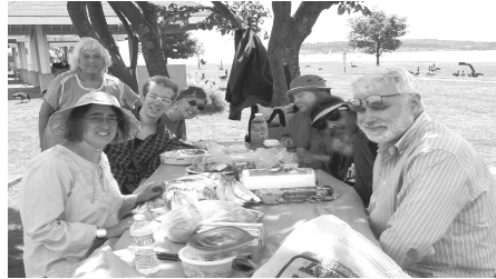
CCB members at this year's Hiroshima-Nagasaki commemoration

In both cases there are very reasonable alternatives. We have plenty of sun, wind, and water to convert to clean energy. The Japanese responded to their nuclear tragedy in 1945 by developing Article 9, a constitutional